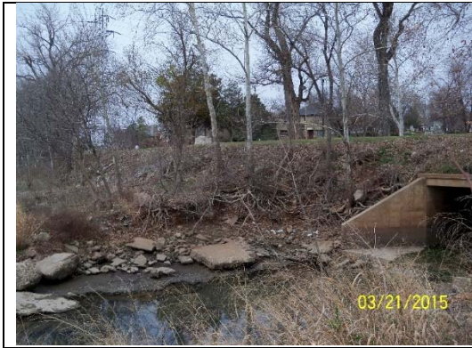
Zink #2051, 10'x10', 3.48' below, Photo 1