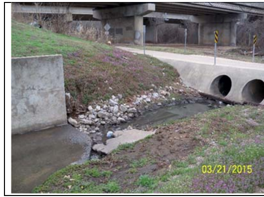
Sand Springs #10006, 60", 1.9' above, Photo2