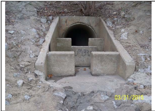
ST/Jenks #4011 54" – 1.15' above, Photo 3