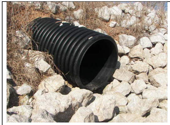
ST/Jenks #4002 42" – 0.5' above, Photo 2