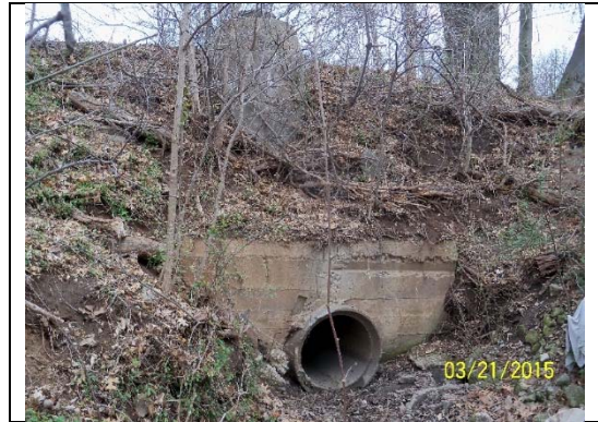
Zink #2037, 30", 0.66' above, Photo 1