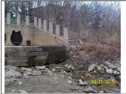
Zink #3006, 36", 1.2' above, Zink #3007, 12", 1.0' above, Photo 1