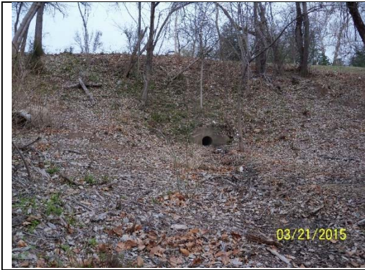
Zink #3014, 18", 1.55' above, Photo 2