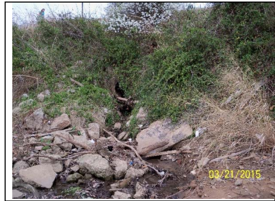
Zink #3012, 24", 1.24' above, Photo 2