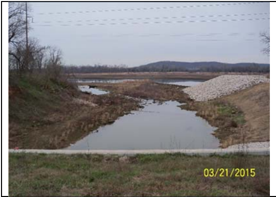
Sand Springs #9012, 3-13'x14', 2.12' below, Photo 3