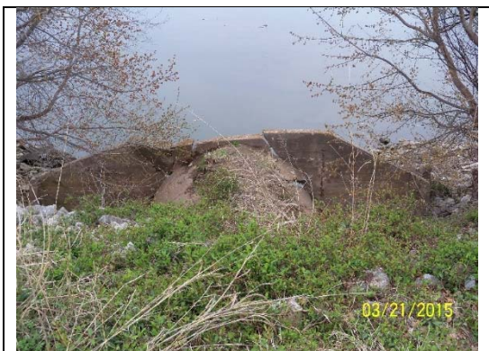
Zink #2036, 96", 3.81' below, Photo 3