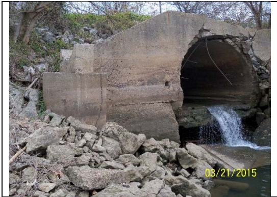
Zink #2036, 96", 3.81' below, Photo 1

The photos below are for stormwater outfalls that are below the pool or within 2 ft above the pool.