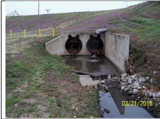
Sand Springs #10006, 60", 1.9' above, Photo 1