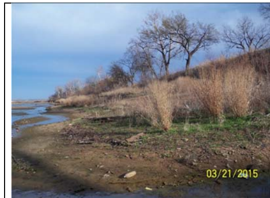
Bixby #12064 4'x4; Flapgate – 1.39' below, Photo 4