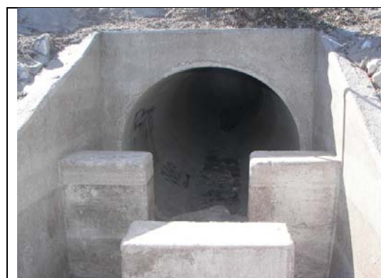
ST/Jenks #4011 54" – 1.15' above, Photo 1