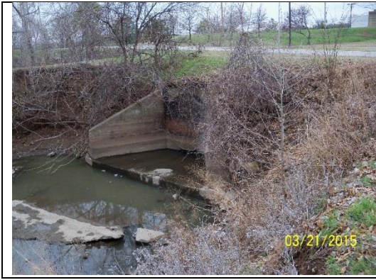
Zink #3001, 84", 2.0' below, Photo 2