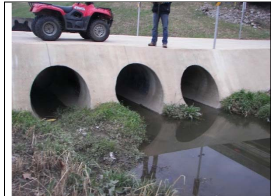
Sand Springs #10005, 3-48", 0.07' above, Photo 2