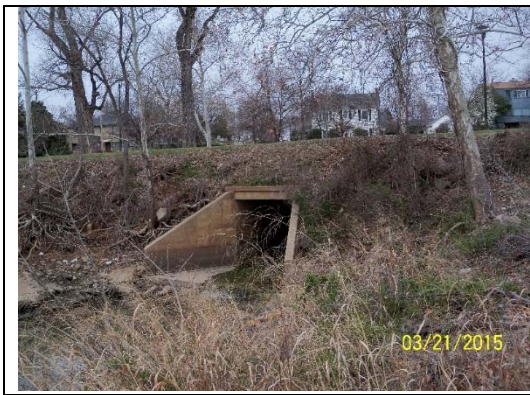
Zink #2051, 10'x10', 3.48' below, Photo 2