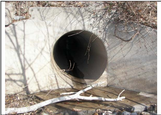
Zink #2042, 40", 1.27' above, Photo 1