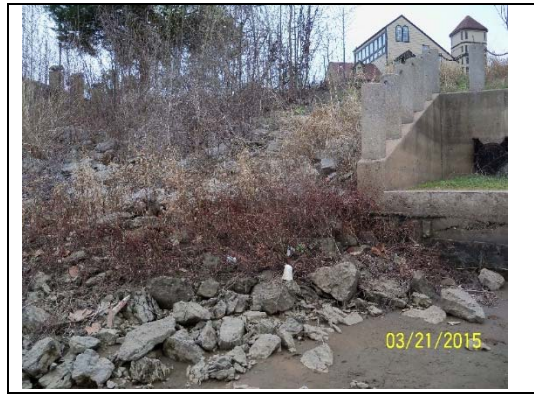
Zink #3003, 24", 1.29' above, Photo 1