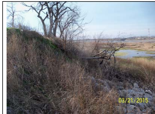
Bixby #12064 4'x4; Flapgate – 1.39' below, Photo 3