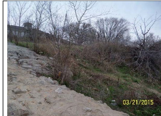
ST/Jenks #4004 42" – 0.01' above, Photo 2