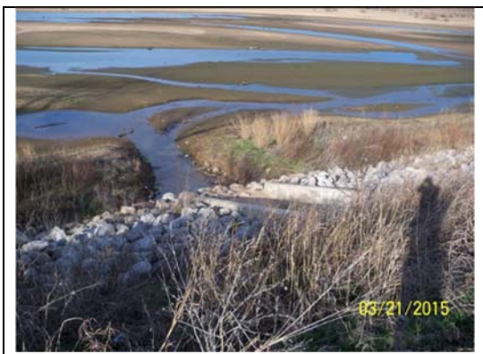
Bixby #12064 4'x4; Flapgate – 1.39' below, Photo 2