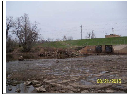
Zink #2066, 96", 2.01' above, Zink #2067, 96", 1.98' above, Photo 1