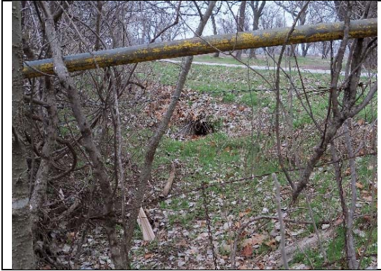
Sand Springs #10004, 18", 1.91' above, Photo 1