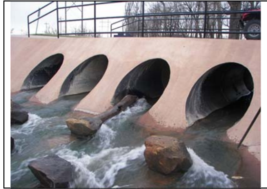
Sand Springs #10001, 4-48'', 0.55' below, Photo 1