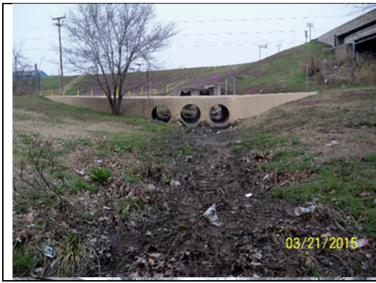
Sand Springs #10005, 3-48", 0.07' above, Photo 3