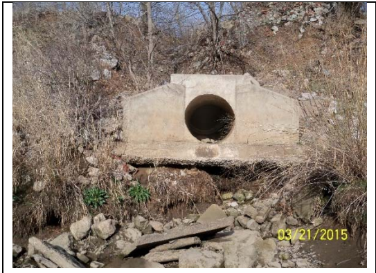
ST/Jenks #4015 48" – 0.38' below, Photo 1