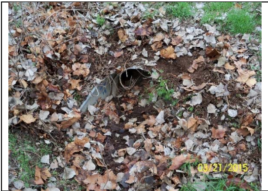
Sand Springs #10004, 18", 1.91' above, Photo 2