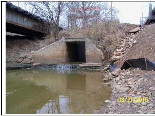
Zink #2063, 10'x10', 1.23' below, Photo 3