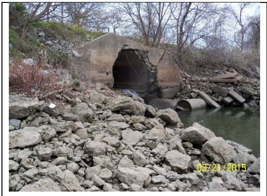
Zink #2036, 96", 3.81' below, Photo 2