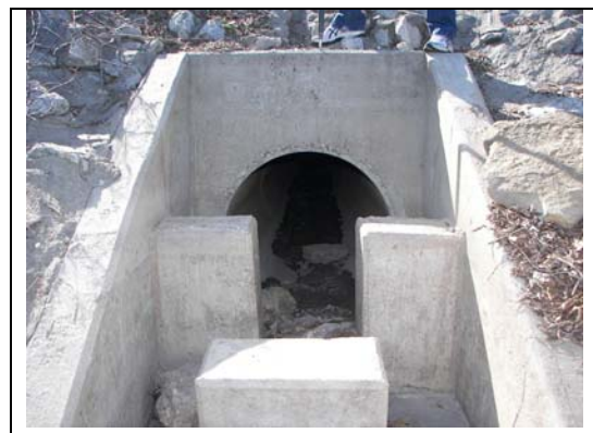
ST/Jenks #4009 36" – 1.18' above, Photo 1