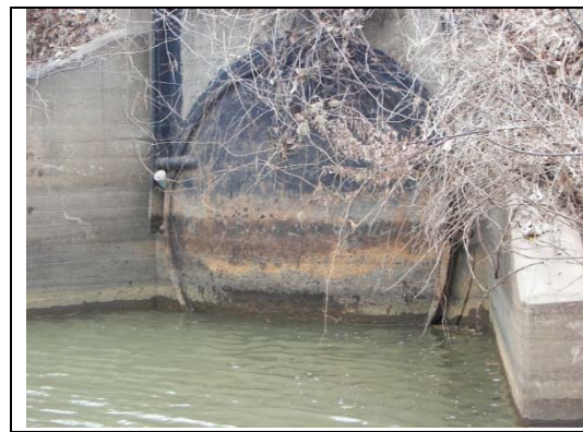
Zink #3001, 84", 2.0' below, Photo 1