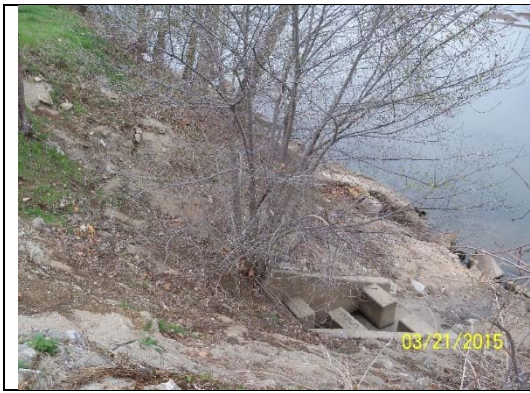
ST/Jenks #4011 54" – 1.15' above, Photo 2