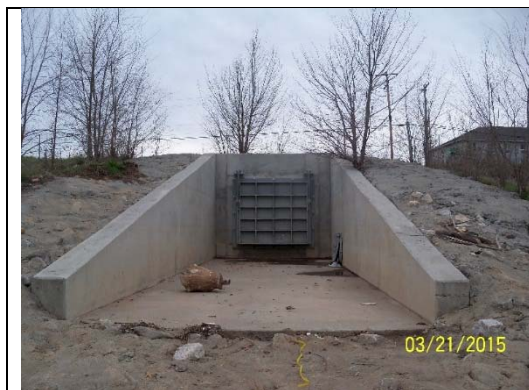
ST/Jenks #4004 42" – 0.01' above, Photo 1