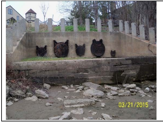
Zink #3003, 24", 1.29' above, Zink #3004, 24", 1.42' above, Zink #3005, 36", 1.15' above, Zink #3006, 36", 1.2' above, Zink #3007, 12", 1.0' above, Photo 1