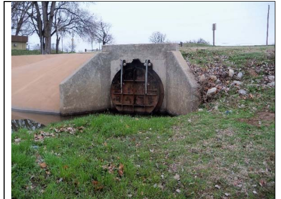
Sand Springs #10002, 72'', 3.17' below, Photo 1