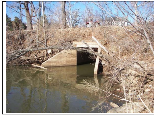
Zink #2051, 10'x10', 3.48' below, Photo 3