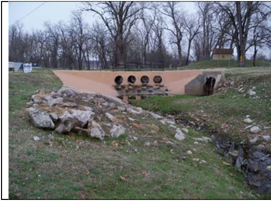
Sand Springs #10001 & #10002, Photo 1