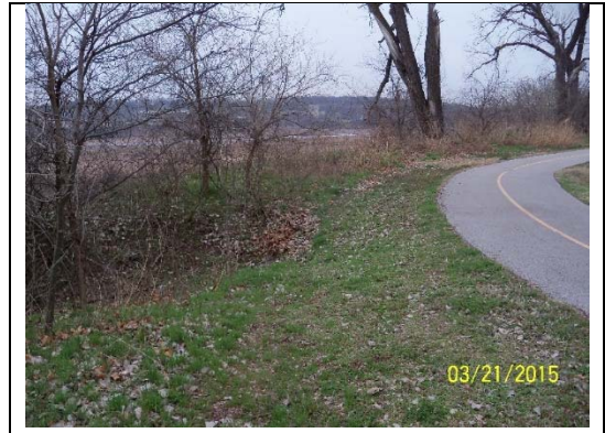
Sand Springs #10004, 18", 1.91' above, Photo 3