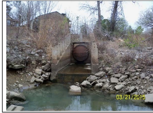
Zink #3002, 60", 1.67' below, Photo 1