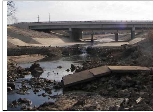
ST/Jenks #5001 74" – 0.01' above, Photo 2