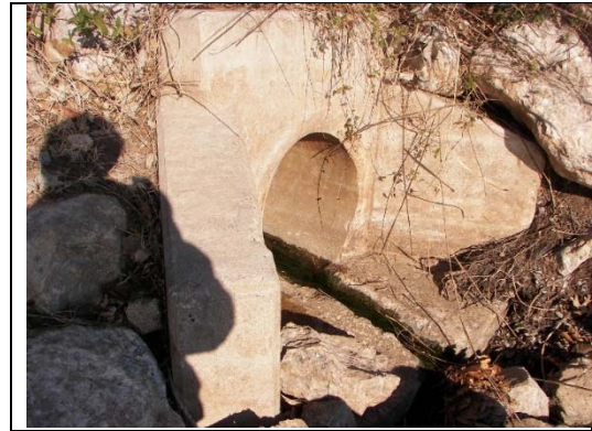
Zink #3012, 24", 1.24' above, Photo 1