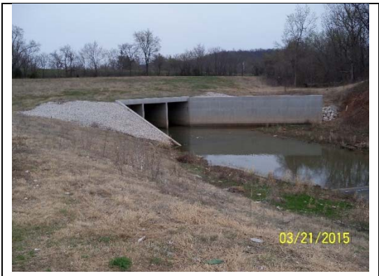
Sand Springs #9012, 3-13'x14', 2.12' below, Photo 2