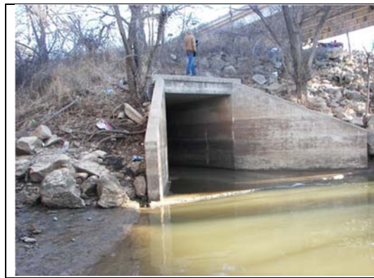
Zink #2063, 10'x10', 1.23' below, Photo 2