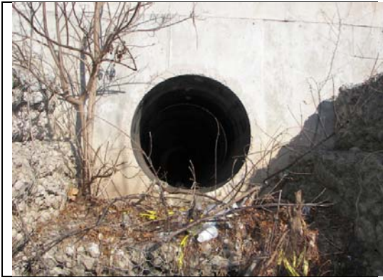
ST/Jenks #4018 60" – 1.34' above, Photo 1