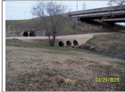
Sand Springs #10005 & #10006, Photo 1