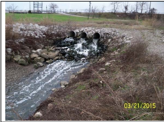
Zink #11025, 3 at 24", 1.33' below, Photo 1