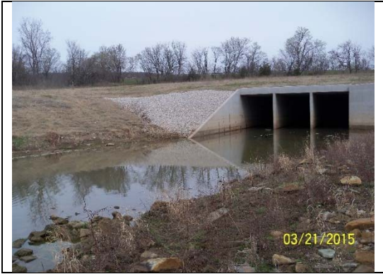
Sand Springs #9012, 3-13'x14', 2.12' below, Photo 1

The photos below are for stormwater outfalls that are below the pool or within 2 ft above the pool.