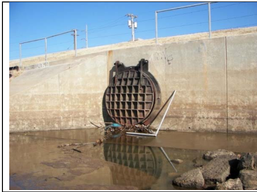
Zink #2064, 108", 1.05' above, Photo 1