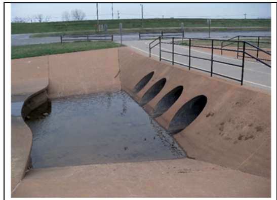
Sand Springs #10001, 4-48'', 0.55' below, Photo 2