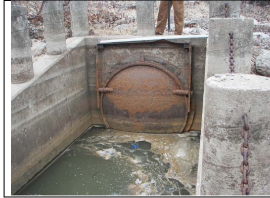
Zink #3002, 60", 1.67' below, Photo 2