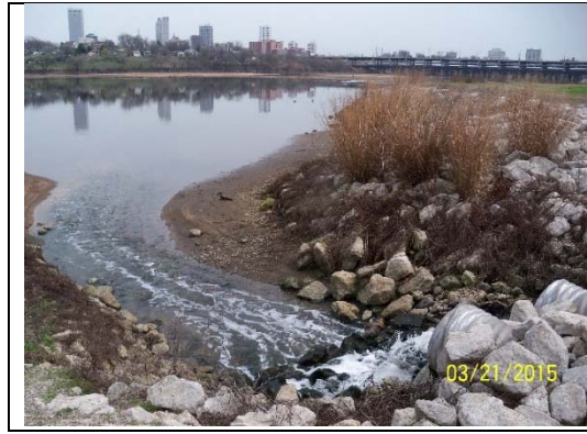
Zink #11025, 3 at 24", 1.33' below, Photo 2