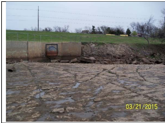
Zink #2065, 96", 1.05' above, Photo 1