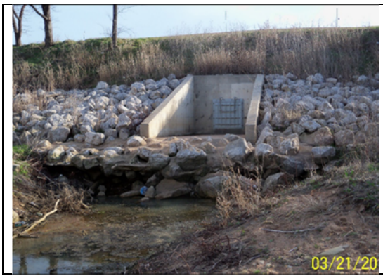
Bixby #12064 4'x4; Flapgate – 1.39' below, Photo 1

The photos below are for stormwater outfalls that are below the pool or within 2 ft above the pool.