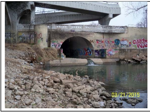
Zink #2040, 22'x14', 1.3' below, Photo 1