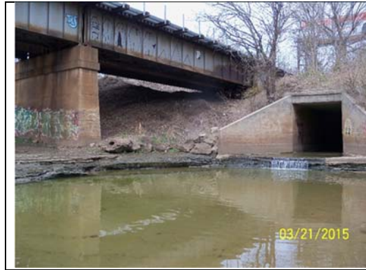
Zink #2063, 10'x10', 1.23' below, Photo 1