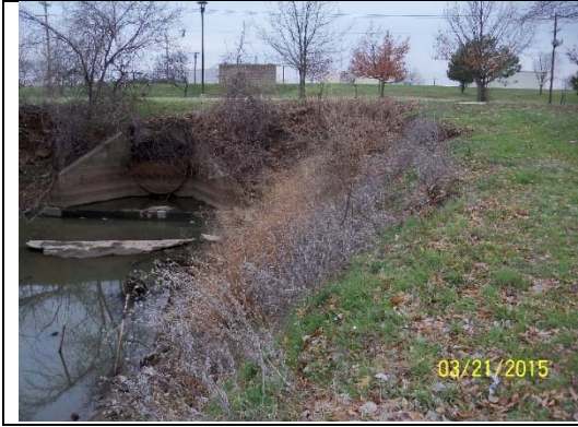
Zink #3001, 84", 2.0' below, Photo 3