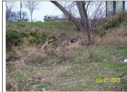
Zink #2043, 18", 1.52' above, Photo 2