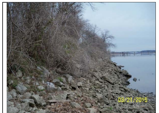
Zink #2037, 30", 0.66' above, Photo 3