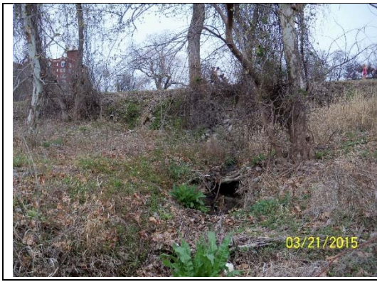
Zink #2048, 36", 1.89' below, Photo 1