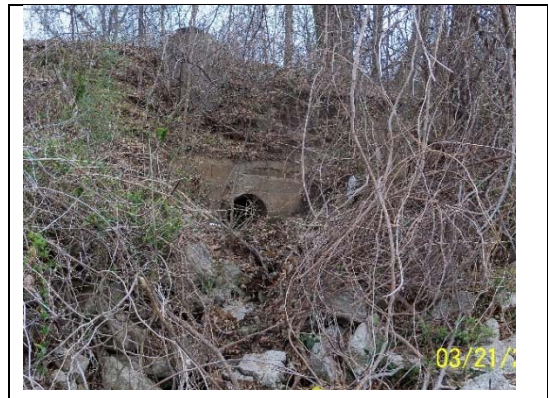
Zink #2037, 30", 0.66' above, Photo 2