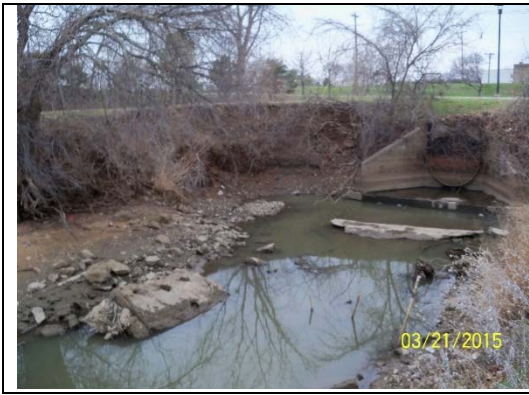
Zink #3001, 84", 2.0' below, Photo 4