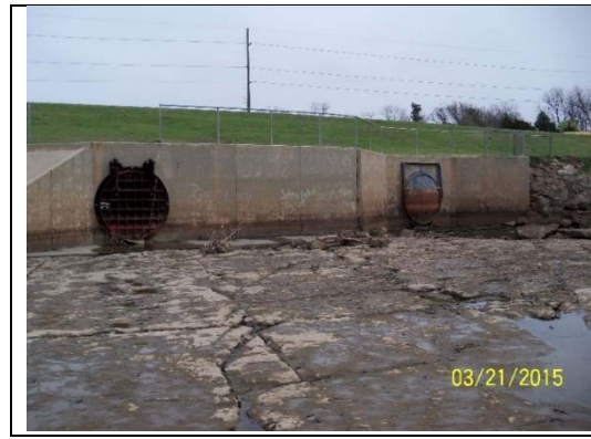
Zink #2064, 108", 1.05' above, Zink #2065, 96", 1.05' above, Photo 1