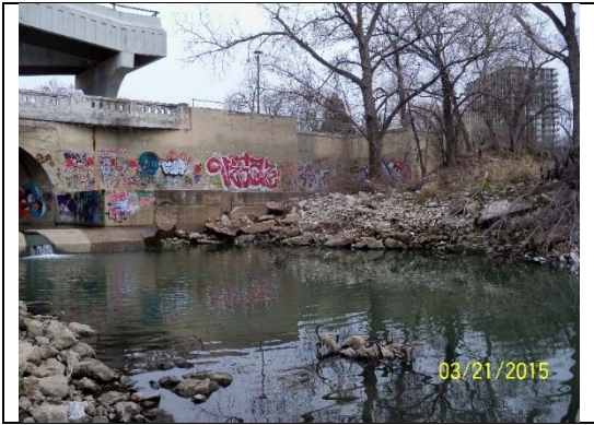
Zink #2040, 22'x14', 1.3' below, Photo 2