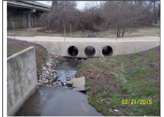
Sand Springs #10005, 3-48", 0.07' above, Photo 1