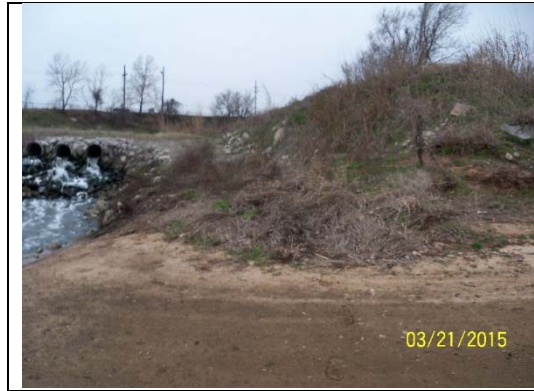
Zink #11025, 3 at 24", 1.33' below, Photo 3