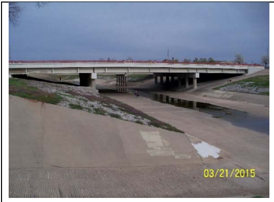
ST/Jenks #5001 74" – 0.01' above, Photo 1