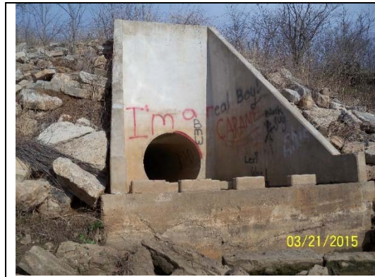
ST/Jenks #4016 60" – 3.22' below, Photo 1