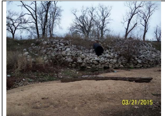
ST/Jenks #4002 42" – 0.5' above, Photo 1

The photos below are for stormwater outfalls that are below the pool or within 2 ft above the pool.