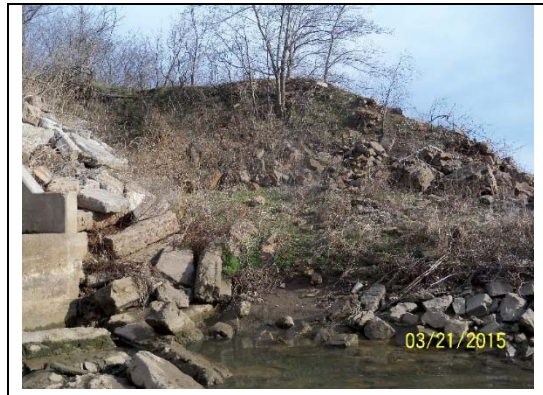
ST/Jenks #4016 60" – 3.22' below, Photo 2