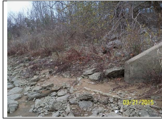
Zink #3008, 18", 1.62' below, Photo 2