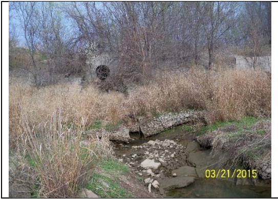
ST/Jenks #4018 60" – 1.34' above, Photo 1