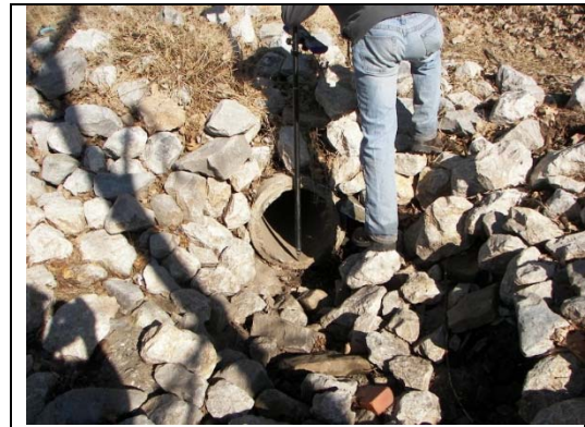
Zink #2043, 18", 1.52' above, Photo 1