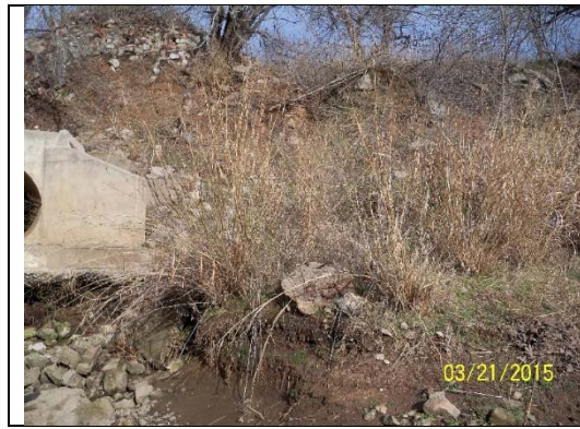
ST/Jenks #4004 42" – 0.01' above, Photo 1