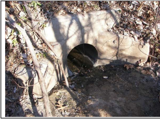
Zink #3014, 18", 1.55' above, Photo 1