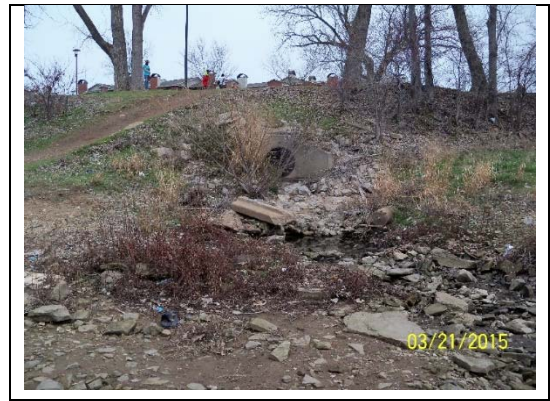
Zink #2042, 40", 1.27' above, Photo 2